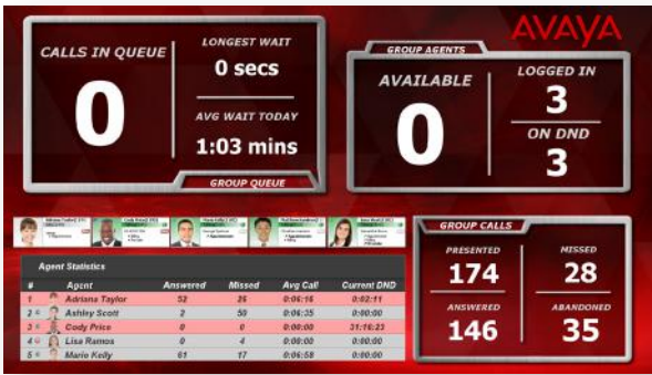
Call Reporting Realtime Dashboard